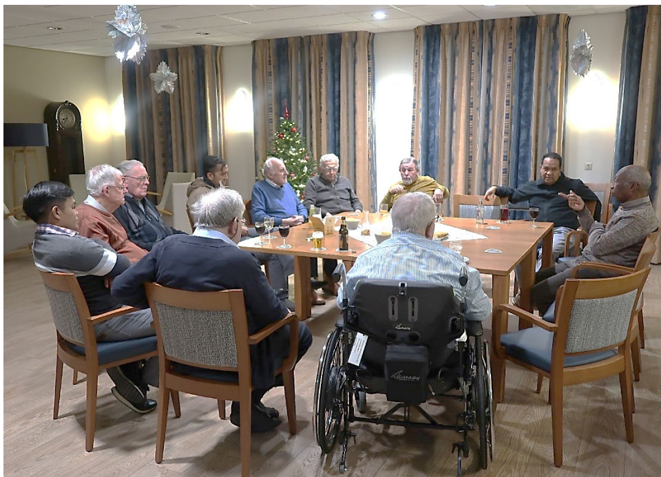
Farewell evening in the decorated living room of brotherhouse Depoorter.

The next morning, the General Executive met with the Executive of Dutch District to learn about mutual well-being and future plans. This had already happened in Belgium with the Belgian District Executive.