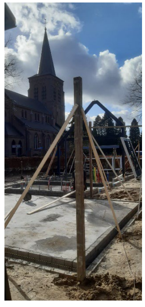
Vessem: the new construction starts with pouring a solid foundation.

In Vessem at the Pilgrims Hostel Cafarnaum , one of the outbuildings has been torn down; the contractor has started with the new construction. In the latter, there will be room for a bike storage, a toilet for invalids, facilities for elementary school pupils who pay a one-day pilgrim's visit, storage areas for, among others, garden tools, and a small workplace for upkeep.